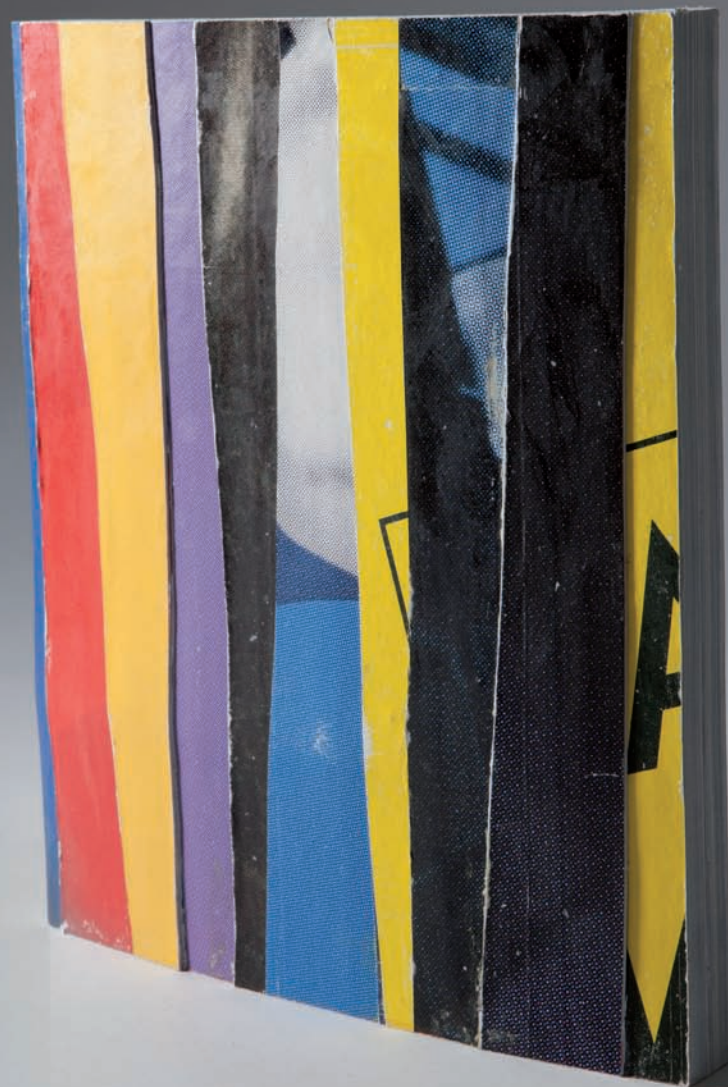
josé untitled one 24,5cm * 26cm © 2012, Pieter Brenner, Project Burnout Décollage: cutting, sewing, polishing € 9.100.- (sold 09/17)