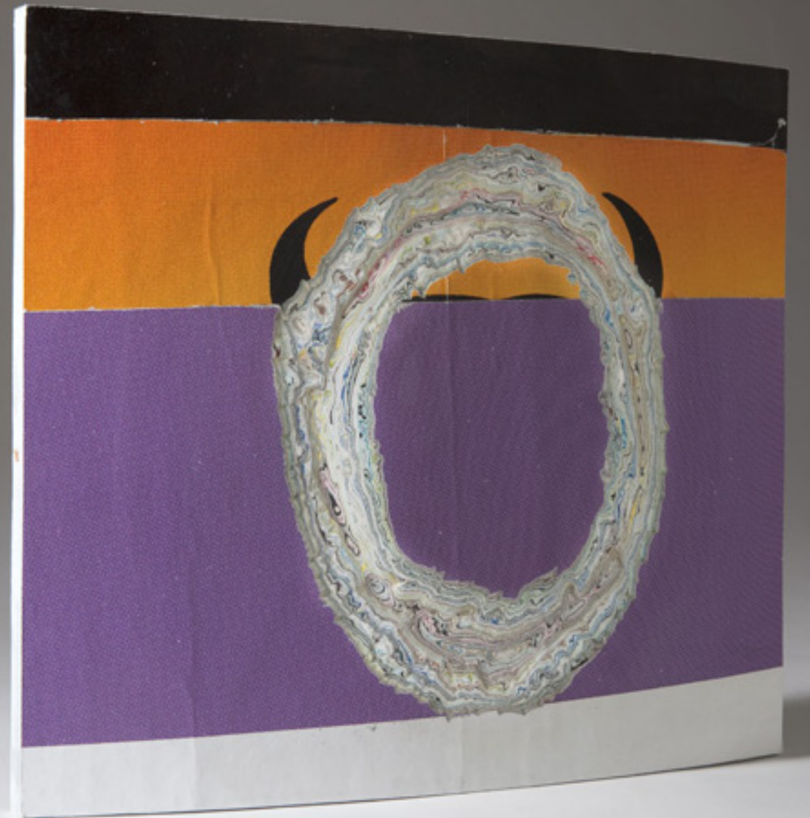
rebecca untitled two 38cm * 45cm © 2012, Pieter Brenner, Project Burnout Décollage: milling, cutting, sewing, polishing € 8.300.-