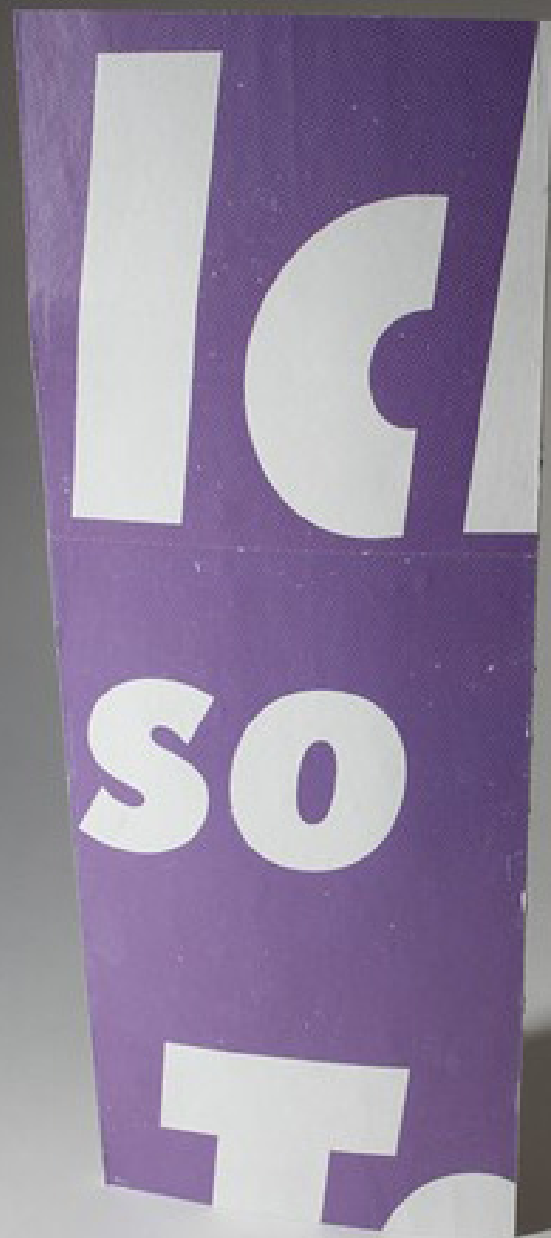
valentin untitled one 22cm * 56,5cm © 2012, Pieter Brenner, Project Burnout Décollage: cutting, sewing, polishing € 8.500.- (reserved 09/17)