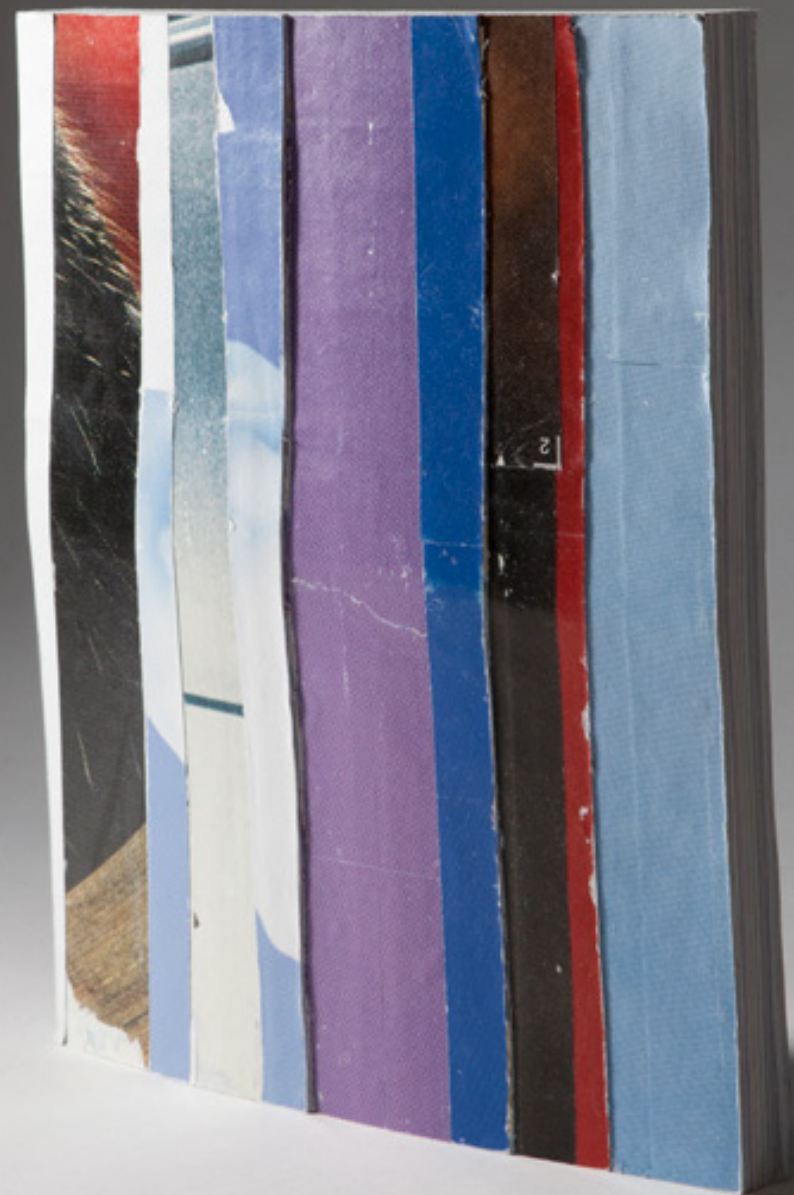
josé untitled two 25cm * 28,5cm © 2012, Pieter Brenner, Project Burnout Décollage: cutting, sewing, polishing € 8.800.-