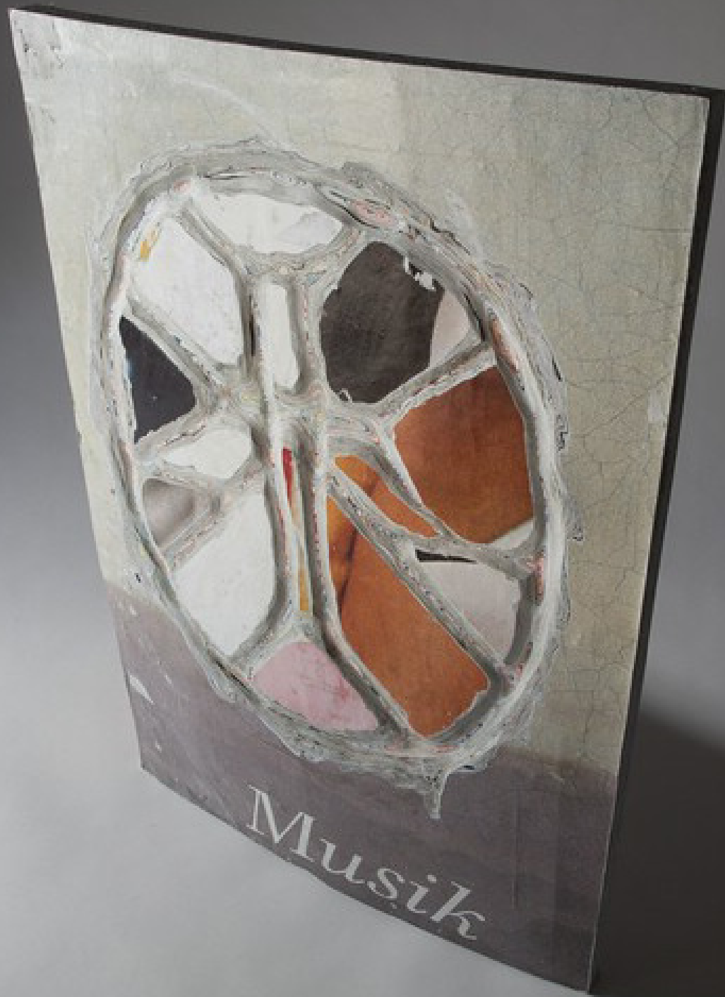
gertrud untitled one 33,5cm * 49,5cm © 2012, Pieter Brenner, Project Burnout Décollage: cutting, sewing, polishing € 9.100.- (reserved 09/17)