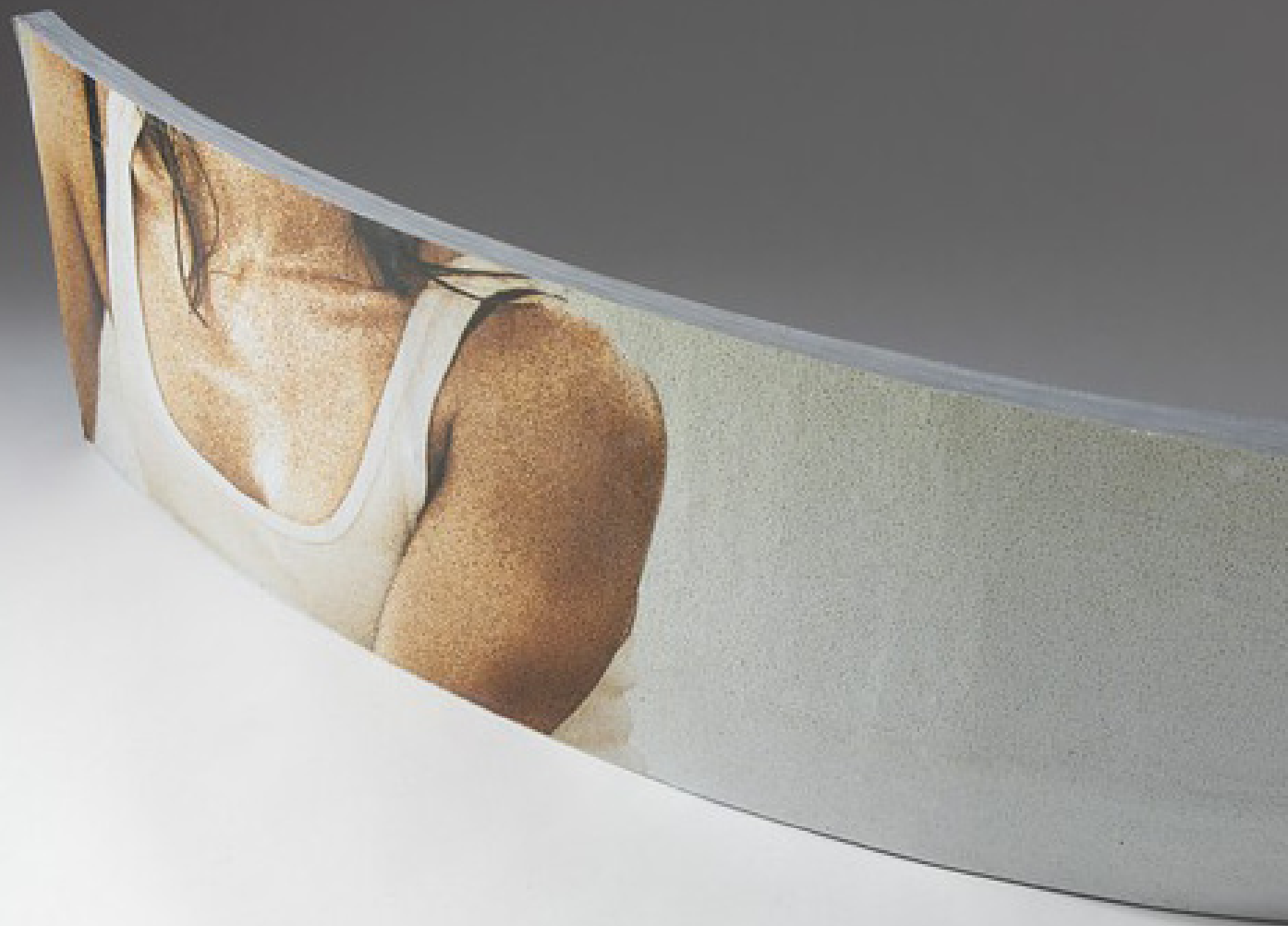
valentin untitled two 25,5cm * 86cm © 2012, Pieter Brenner, Project Burnout Décollage: cutting, sewing, polishing € 9.200.-