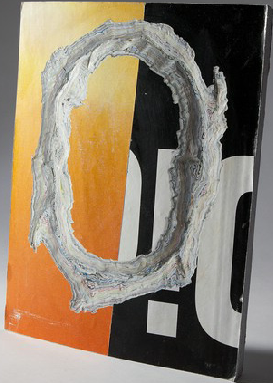
rebecca untitled one 26,5cm * 35cm © 2012, Pieter Brenner, Project Burnout Décollage: milling, cutting, sewing, polishing € 8.800.-