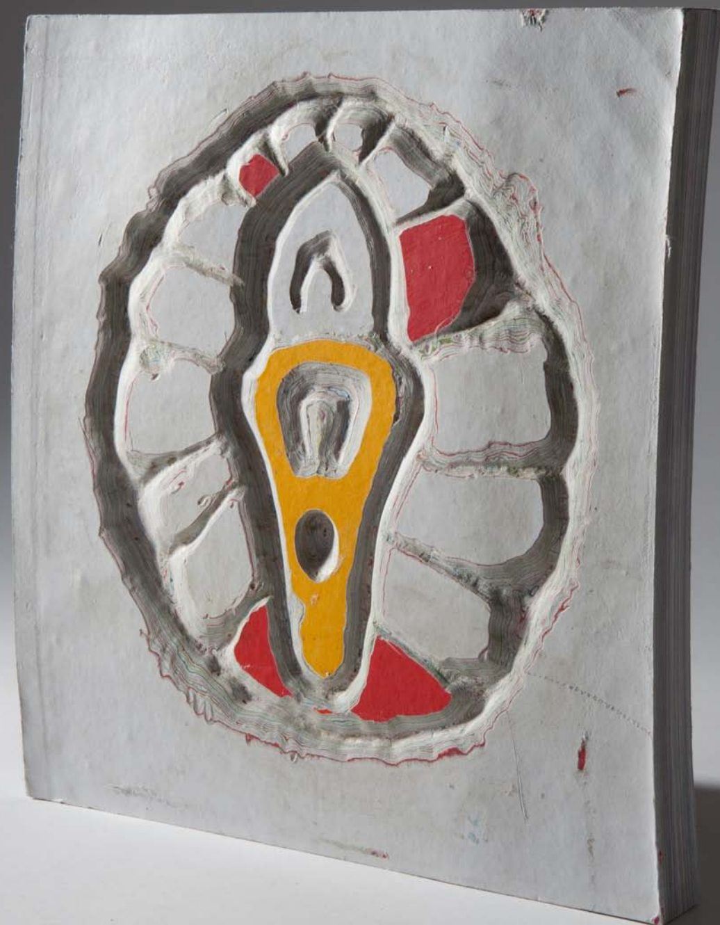
maurice untitled one 27,5cm * 29,5cm © 2012, Pieter Brenner, Project Burnout Décollage: cutting, sewing, polishing € 10.600.- (reserved 09/17)