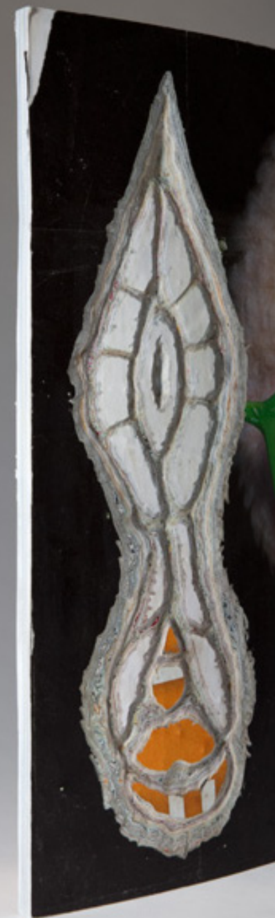
gertrud untitled two 27,5cm * 41cm © 2012, Pieter Brenner, Project Burnout Décollage: cutting, sewing, polishing € 8.700.-