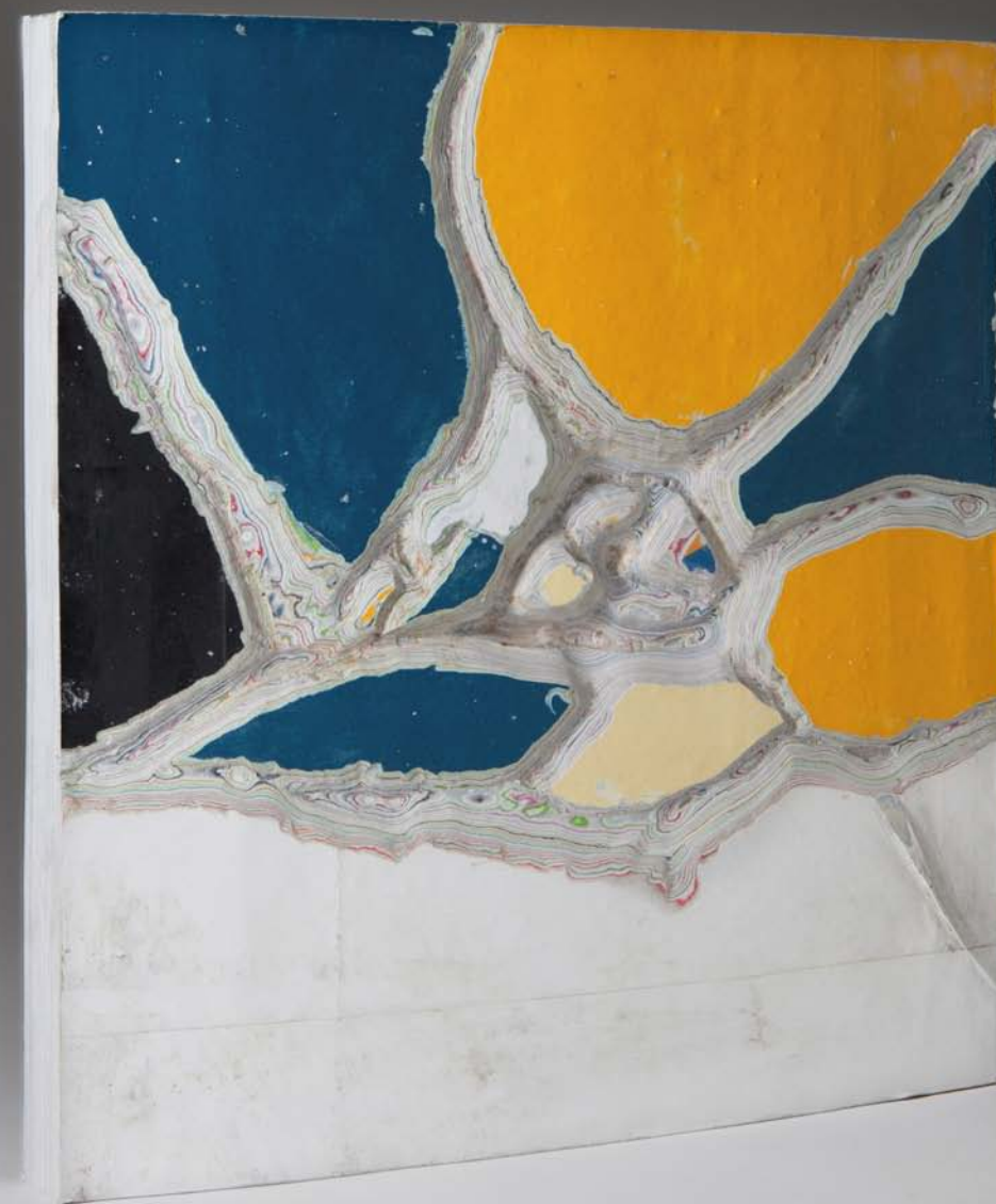
maurice untitled two 30,5cm * 31cm © 2012, Pieter Brenner, Project Burnout Décollage: cutting, sewing, polishing € 10.200.-